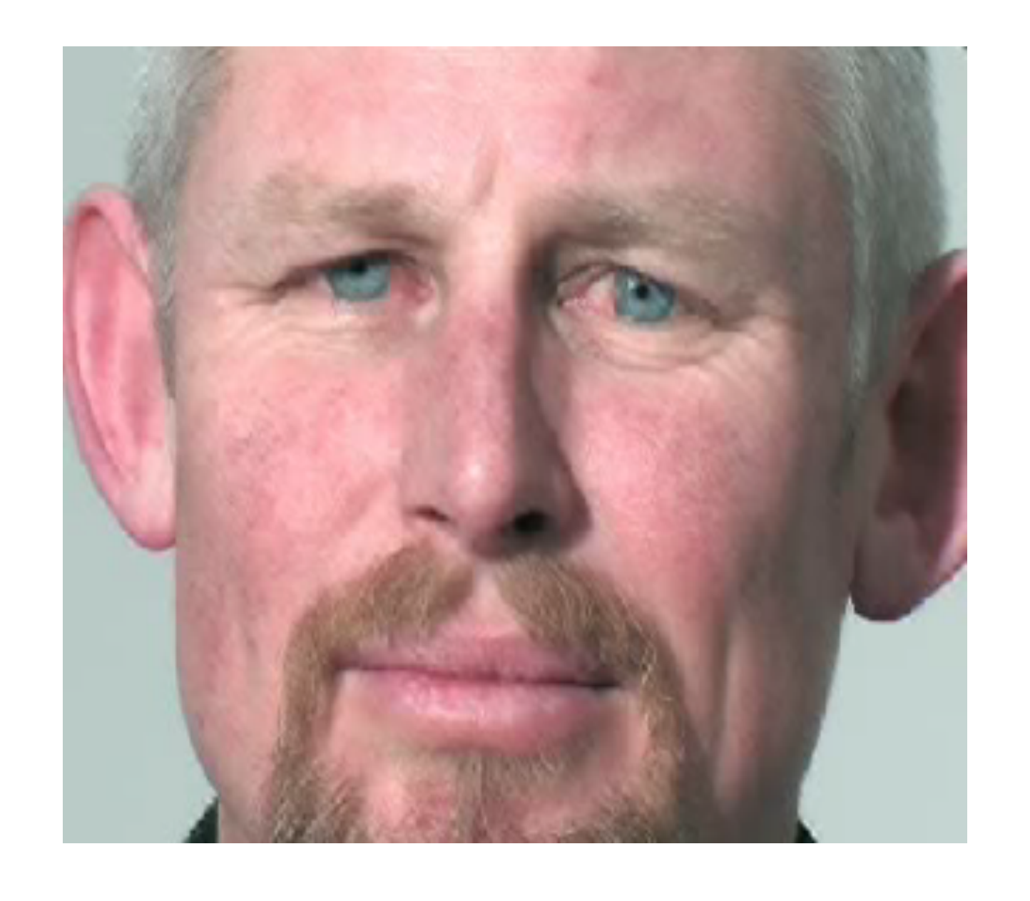
Symptoms from cranial nerve vascular compression can come and go